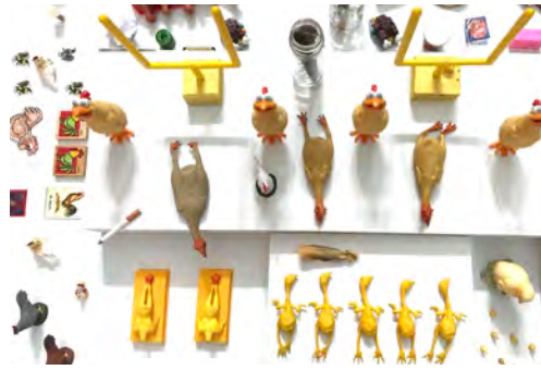
TOP IMAGES: Detail of installation of NOTHING has changed, everything HAS CHANGED ; COVER: Detail of installation of FINGERS ARE CROSSED just in case

thousands of 2x2 inch, hand-cut paper and plastic tiles. From left to right, the wall arrangement gradually taps into the order of gradation represented in a color wheel creating multiple, overlapping areas of flat color. The same treatment is also illustrated on the arrangements on the amoeba-shaped tables where various objects that possess the same shade harmoniously exist.